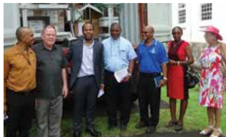
Minister of Health & representatives of the Diocese received the container

The supplies benefited Milton Cato Hospital, St. Benedict Orphanage, Bread of Life Orphanage, Bequia Clinic, Lewis Punnet Nursing Home and the Georgetown Clinic.