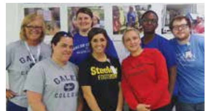
Galen Nursing School