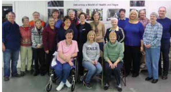
St. Matthews Women's Club