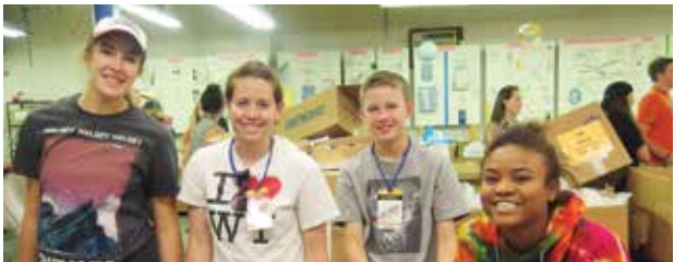
EFCA Iowa, Wisconsin, Wyoming