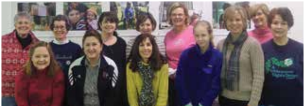
Highlands Mothers Club