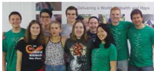
Floyd Central High School