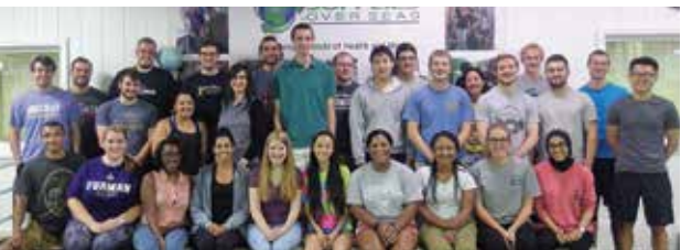
U of L