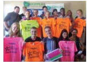
World Affairs Council