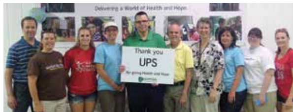
UPS Green Team