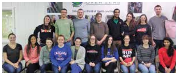
U of L Med Students