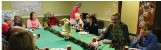
Volunteer Christmas Lunch