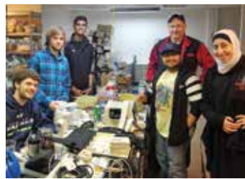
U of L Biomed students